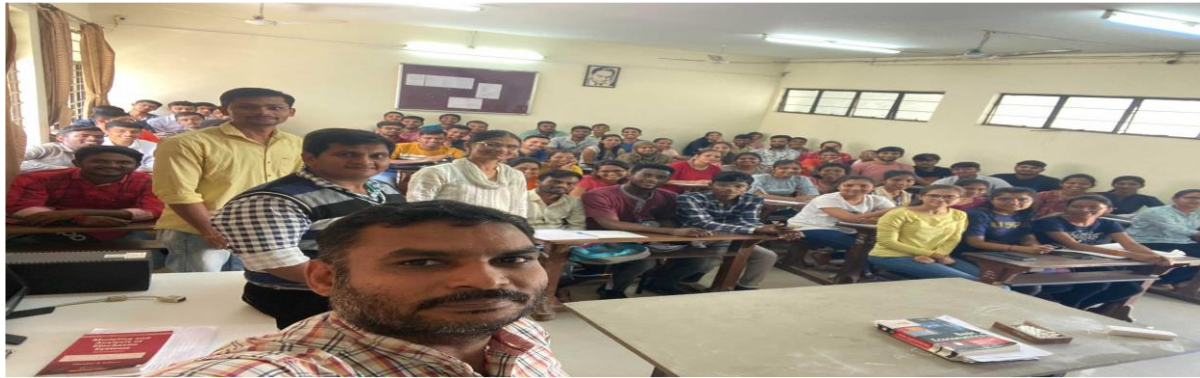
1 of the 5 MSc Classrooms with IT facility – Students Interaction with Alumni