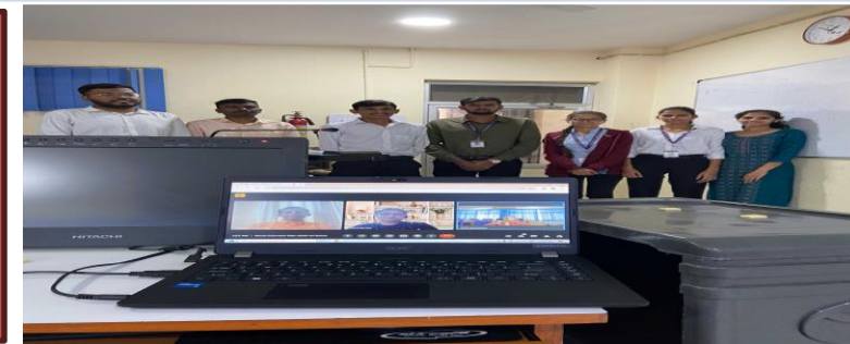
BSR Computer /IT Lab 50 PC: SPSS, SQL, R, Python, ... SAS, Mock Interview

Two Computer Laboratories Equipped with Software