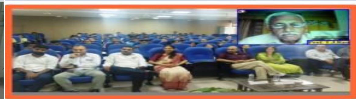
125 seat capacity Air-Conditioned Auditorium with Stage, Sound, IT facility 4