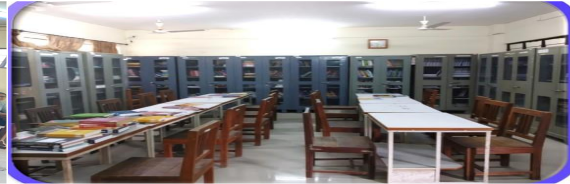
MSc Library: 2500 books on Statistics, Quality, Computing with IT facility