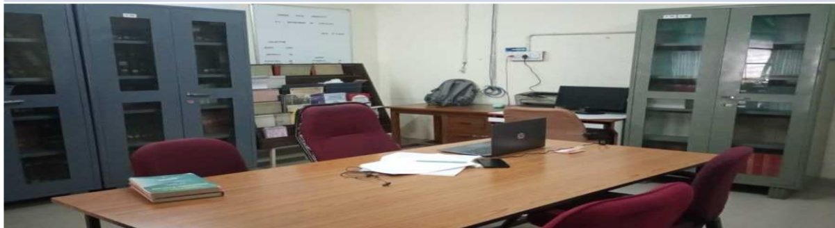
Research Library: Volumes of 50 Journals, 250+ Research level books with IT facility