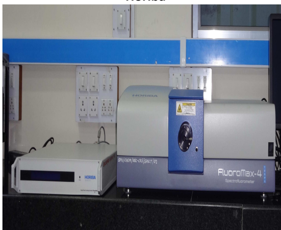
Spectrofluorometer, Fluoromax – 4 Horiba