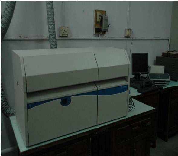
High Temperature Gel Permeation Chromatograph (GPC) Polymer Labs