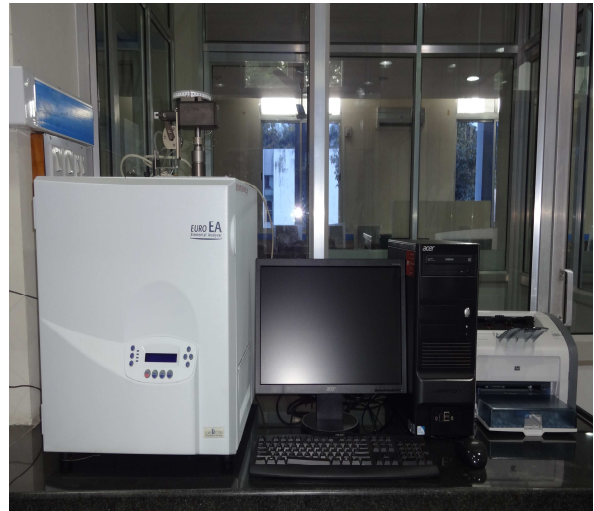
Elemental Analyzer Eurovector Instruments