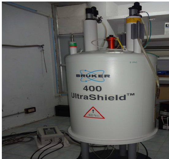
NMR-400 MHz Bruker