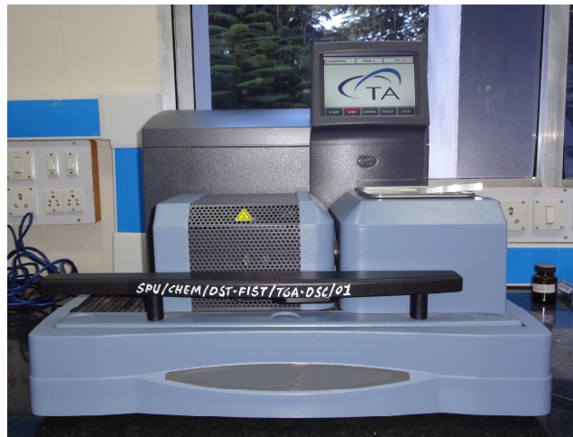
Simultaneous TGA – DSC, SDT Q600 TA Instruments